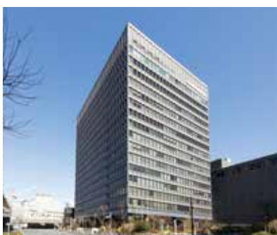
Office (Chiyoda-ku, Tokyo)