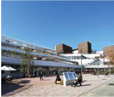
Retail Facility (Fujisawa City, Kanagawa)