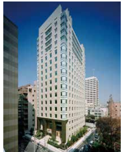
Office (Chiyoda-ku, Tokyo)