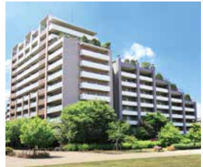
Residence (Suginami-ku, Tokyo)