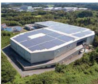
Logistics Facility (Narita City, Chiba)