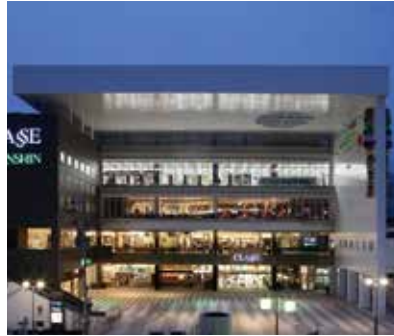
Retail Facility (Kobe City, Hyogo)