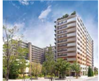
Residence (Adachi-ku, Tokyo)