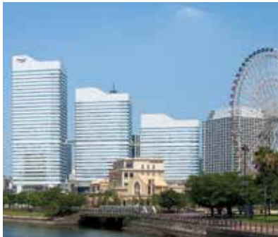
Complex Facility (Yokohama City, Kanagawa)