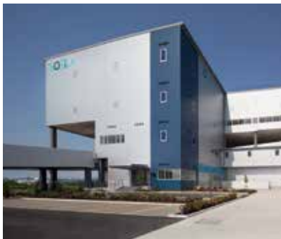
Logistics Facility (Sagamihara City, Kanagawa)