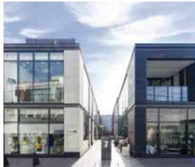
Retail Facility (Shibuya-ku, Tokyo)