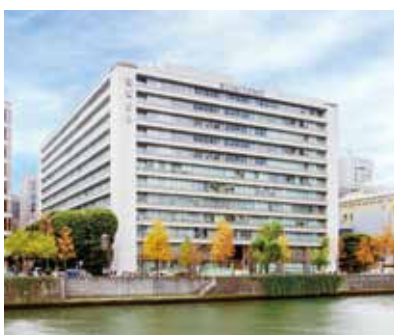
Office (Osaka City, Osaka)