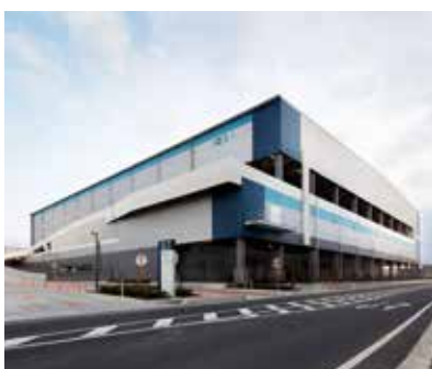
Logistics Facility (Kasukabe City, Saitama)