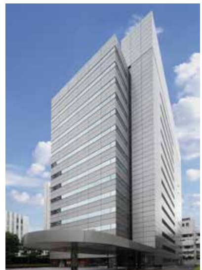
Office (Chiyoda-ku, Tokyo)