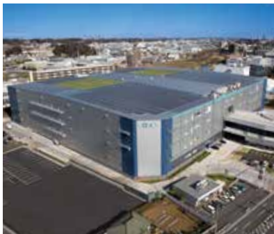
Logistics Facility (Yokohama City, Kanagawa)